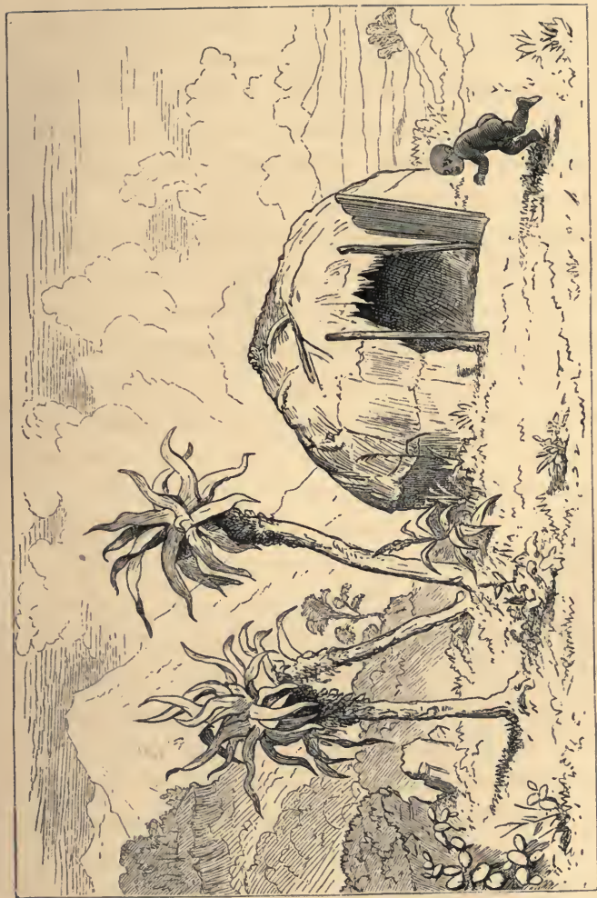
AN "OWNER" OF THE LAND.—PAGE 42.